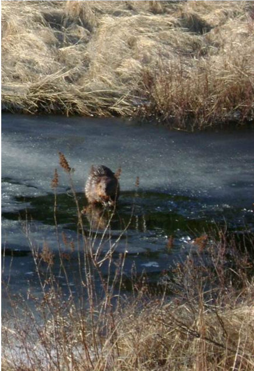
As the waters warmed we began to see more of our woodland friends. This beaver was in a nearby creek seemingly playing around and enjoying the open water in addition to searching for food.